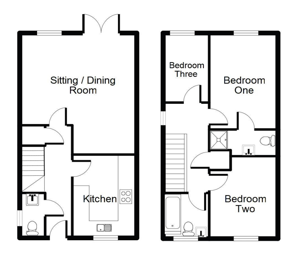
For identification only - Not to scale

MONEY LAUNDERING REGULATIONS 2003: Purchasers will be asked to produce identification and proof of financial status when an offer is received. We would ask for your co-operation in order that there will be no delay in agreeing the sale.